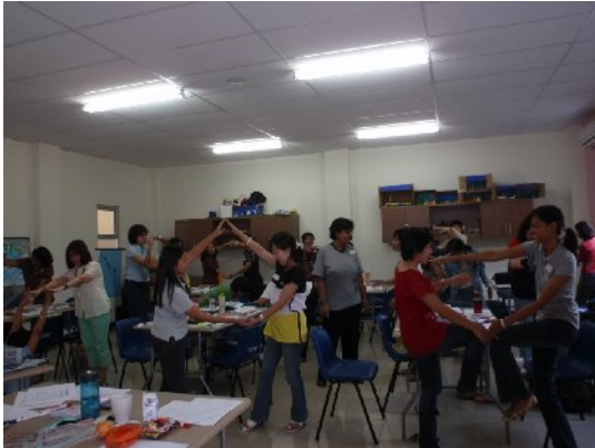
Trained teachers at St. John's Catholic School in active teaching and learning.