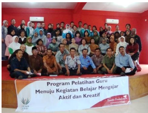
Active Learning – Teachers – Asian Agri – Sumatra Utara