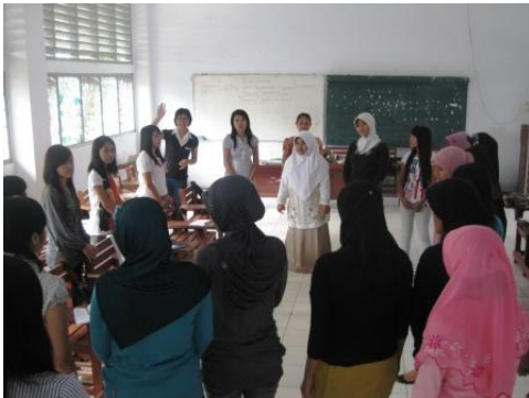
Creativity Education – Teacher students – Bengkulu University (Faculty of Early Childhood Education)