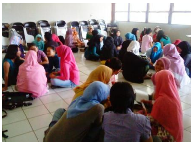
Degree program - Creativity Education – Lesson Planning – Teacher Students – State University of Jakarta (Faculty of Early Childhood Education)

Date of publication: 18 th November 2010