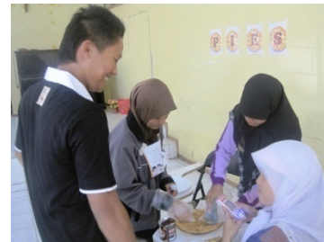
Creativity Education – Teacher students - University of Education Indonesia (Elementary Education Campus)