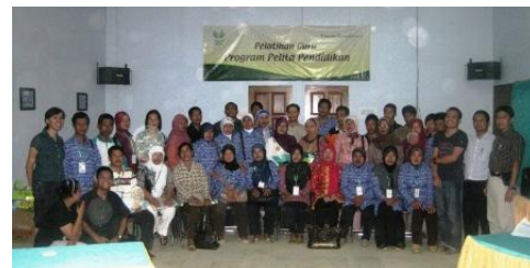
Small Library Management – Teachers – Tanoto Foundation - Jambi, Sumatra Utara, Riau