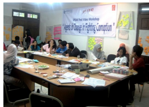
Creative Thinking for youth fighting corruption – Students – Transparency International Indonesia