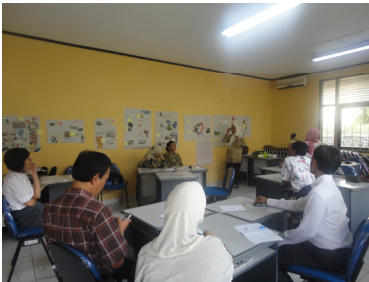
Capacity Upgrade of Lecturers – University of Education Indonesia (Elementary Education Campus)

Creativity Education – Teacher students - University of Education Indonesia (Elementary Education Campus)